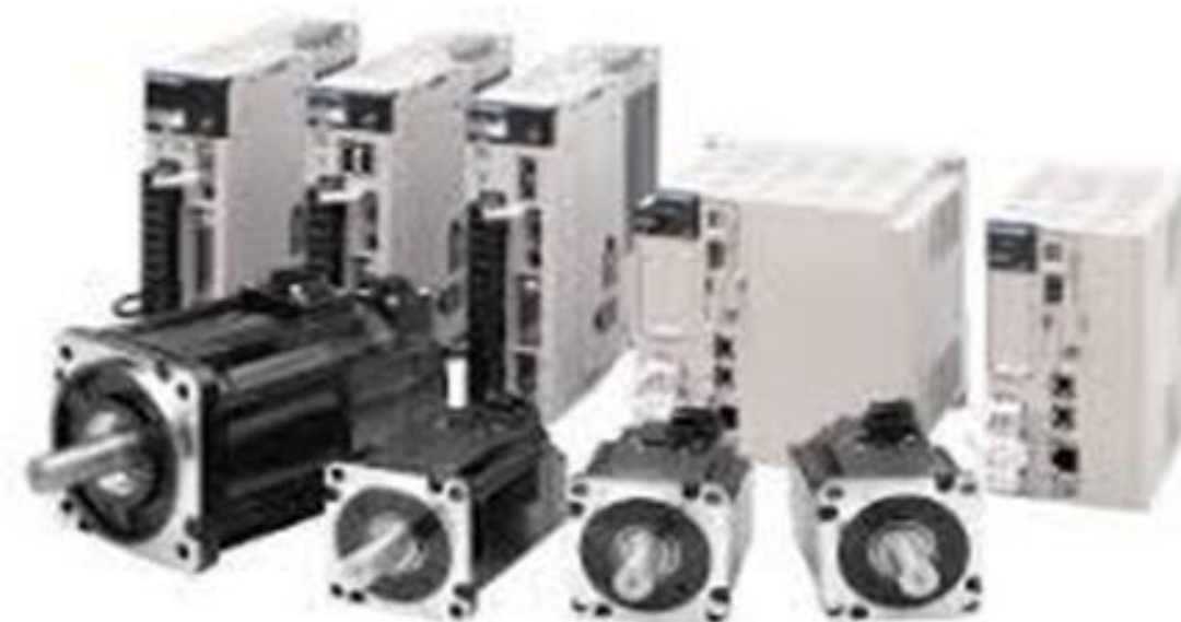
Motion Controller, Servo-motor and Drives, VFDs