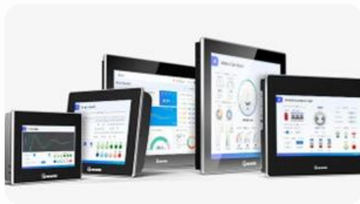
HMI - SCADA Industrial and Renewable